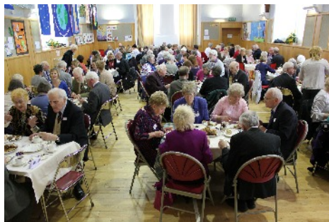
A celebratory meal in the North Hall

During 2013 the Minister conducted 1 baptism, 5 weddings and 30 funerals.