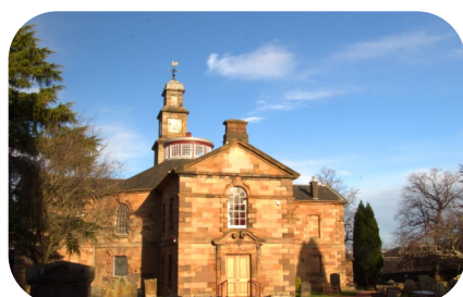
Photos of the Old Parish