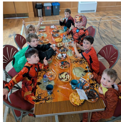
Fun at the Anchors and Junior Section