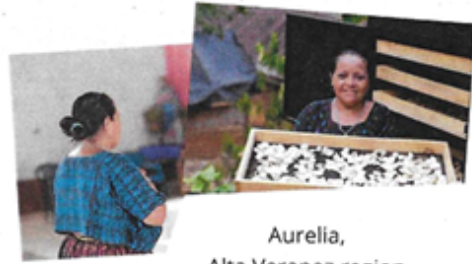
Aurelia, Alta Verapaz region of Guatemala